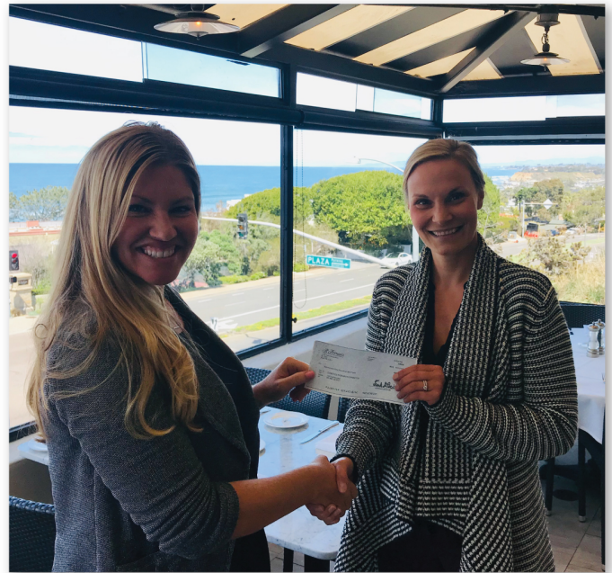
"This is a photo of Il Fornaio presenting DRC with a donation from their fundraiser."

We have been so overwhelmed by the support of our community this year. Many DRC partners have hosted fundraisers to benefit our organization. One example is the St. Patrick's Day fundraiser in Chicago at an Irish pub, 'Harrigan's Hooligans against Diabetes'. We also had a fundraiser at our favorite local Italian restaurant in the Del Mar Plaza, Il Fornaio. So many people showed up and ate amazing Italian cuisine while helping to raise funds to support our mission. These events have reminded us it takes a community to connect for a cure!