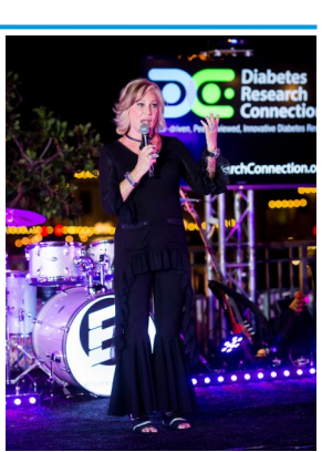
Saturday, September 30, 2023